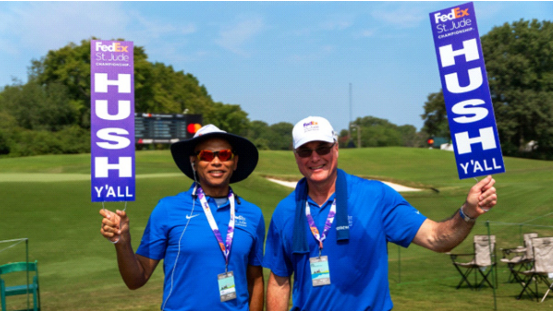
Legendary 'Hush Ya'll' volunteers show how it's done with a smile. You can have this coveted position by volunteering for it and other prime positions to show why Tennessee is nicknamed the Volunteer State!

MEMPHIS, Tennessee – The FedEx St. Jude Championship is thrilled to announce volunteer registration is now live for the 2025 event and is filling up quickly. There are a variety of different volunteer committees available to participate in when the PGA TOUR returns to Memphis for the opening event of the FedExCup Playoffs.